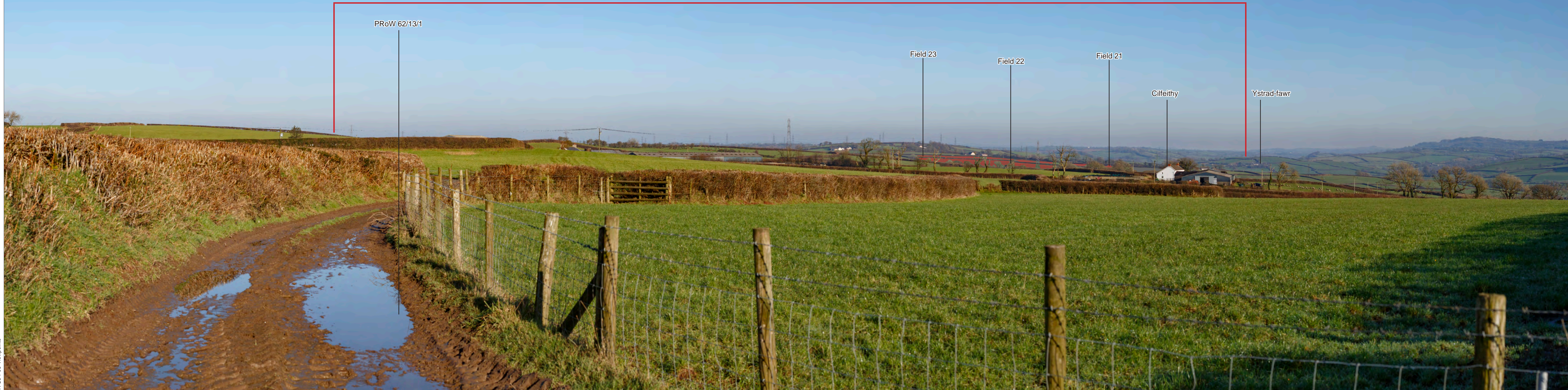
Solar Area East Approximate Site Extents