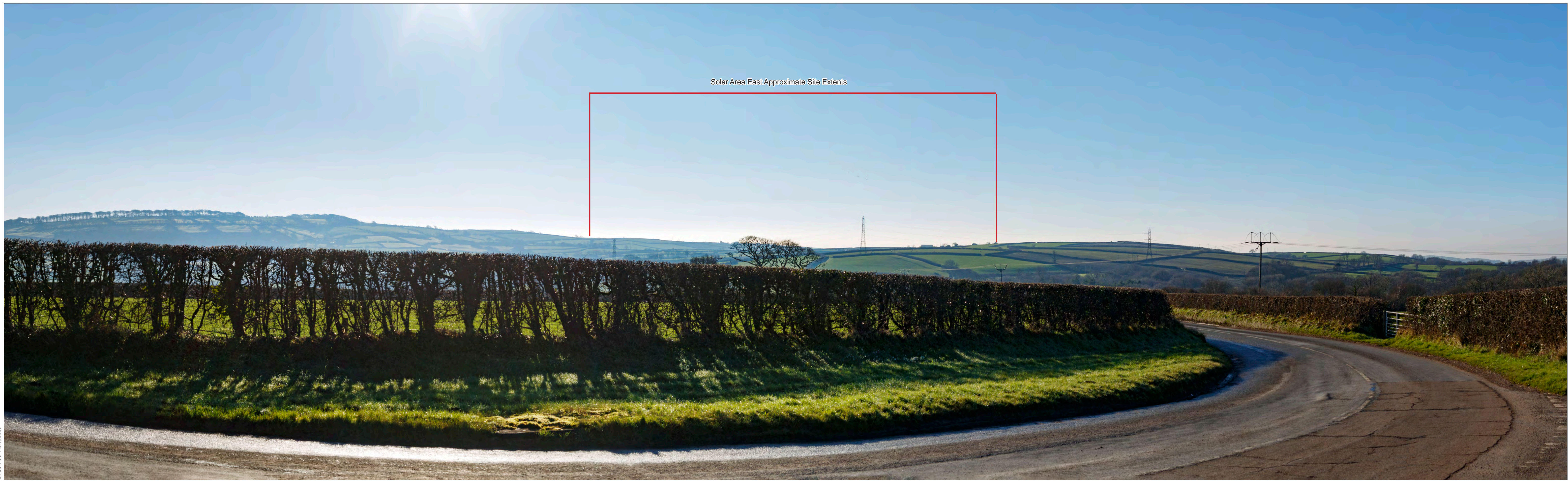
Solar Area East Approximate Site Extents

5302-RPS-XX-XX-DR-L-91XX-S3-P06-Viewpoints